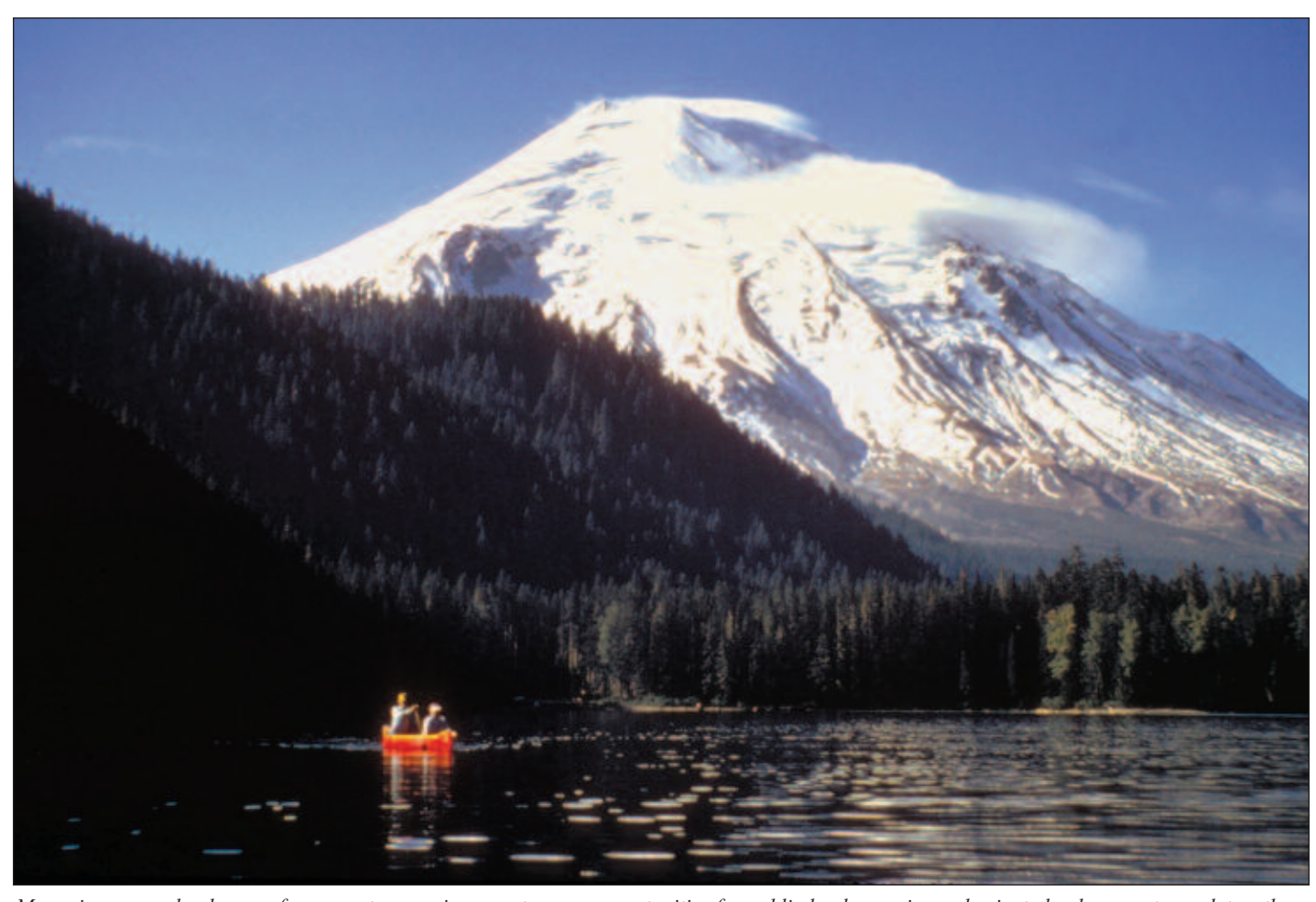
Managing across landscapes for ecosystem services creates new opportunities for public land agencies and private landowners to work together.

Not a panacea. Although market-based approaches will likely have an important role to play in encouraging private landowners to protect and enhance ecosystem services, Kline warns that they are not a panacea. "For any policy approach to work, you have to be able to measure performance—what will you get by investing in a particular approach in one location or another—and you have to be able to enforce and verify that performance over time. Those challenges exist regardless of whether you are using regulation, tax credits, or cost-sharing to encourage markets" says Kline. "Each approach has the potential to achieve similar outcomes, but for markets, success also depends on being able to institute a regulatory framework that provides an incentive for trading. Then you have to hope that the costs of negotiating tradeswhat economists call "transaction costs"—can be reduced to the point where trades actually will occur. All of that can be a significant hurdle to overcome," says Kline. For these reasons, Kline contends markets are not always better than other policy approaches for conservation and environmental protection.