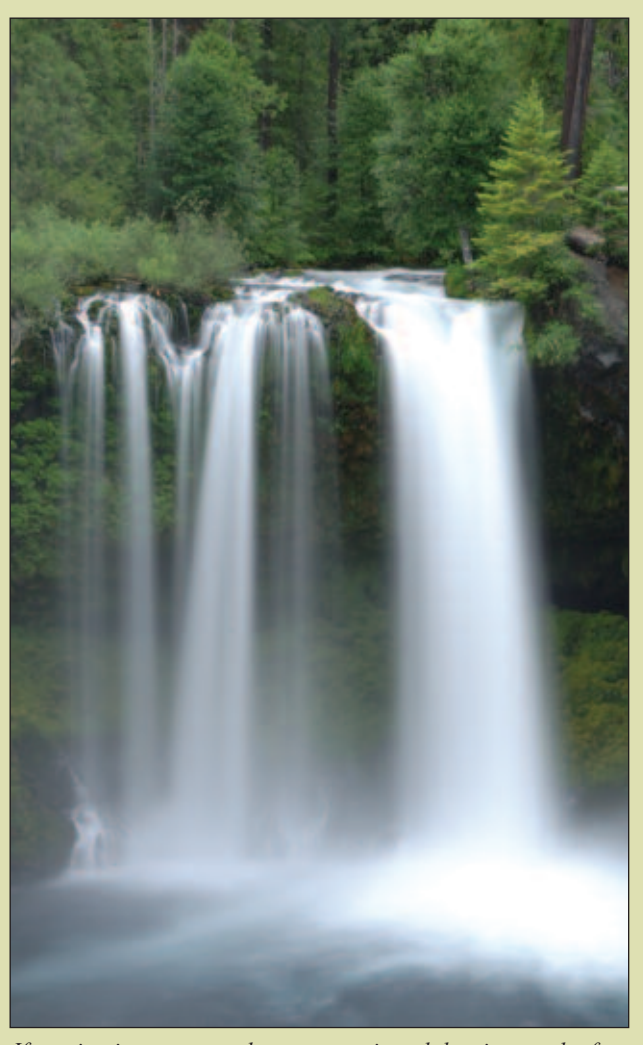
If precipation patterns change as projected, leaving much of the West more arid, water that is stored on and filtered through national forests will become even more valuable.

lands. It will totally eclipse timber." As the impacts of climate change and access to water supplies become more serious public policy issues, this type of research will be vital in illustrating the importance of public forest lands.